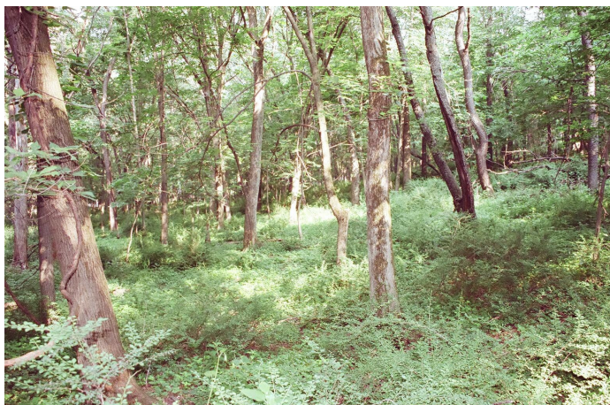
Ownership of the GRANDON PROPERTY was formally transferred to the Nature Center in 2010. Most of the acreage will remain in forest reserve.