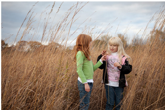
There's always something fascinating going on at ICNC! You'll see more of these girls—photographed in Fall 2010—and their friends on the Center's sparkly "new" website ( www.indiancreeknaturecenter.org ).